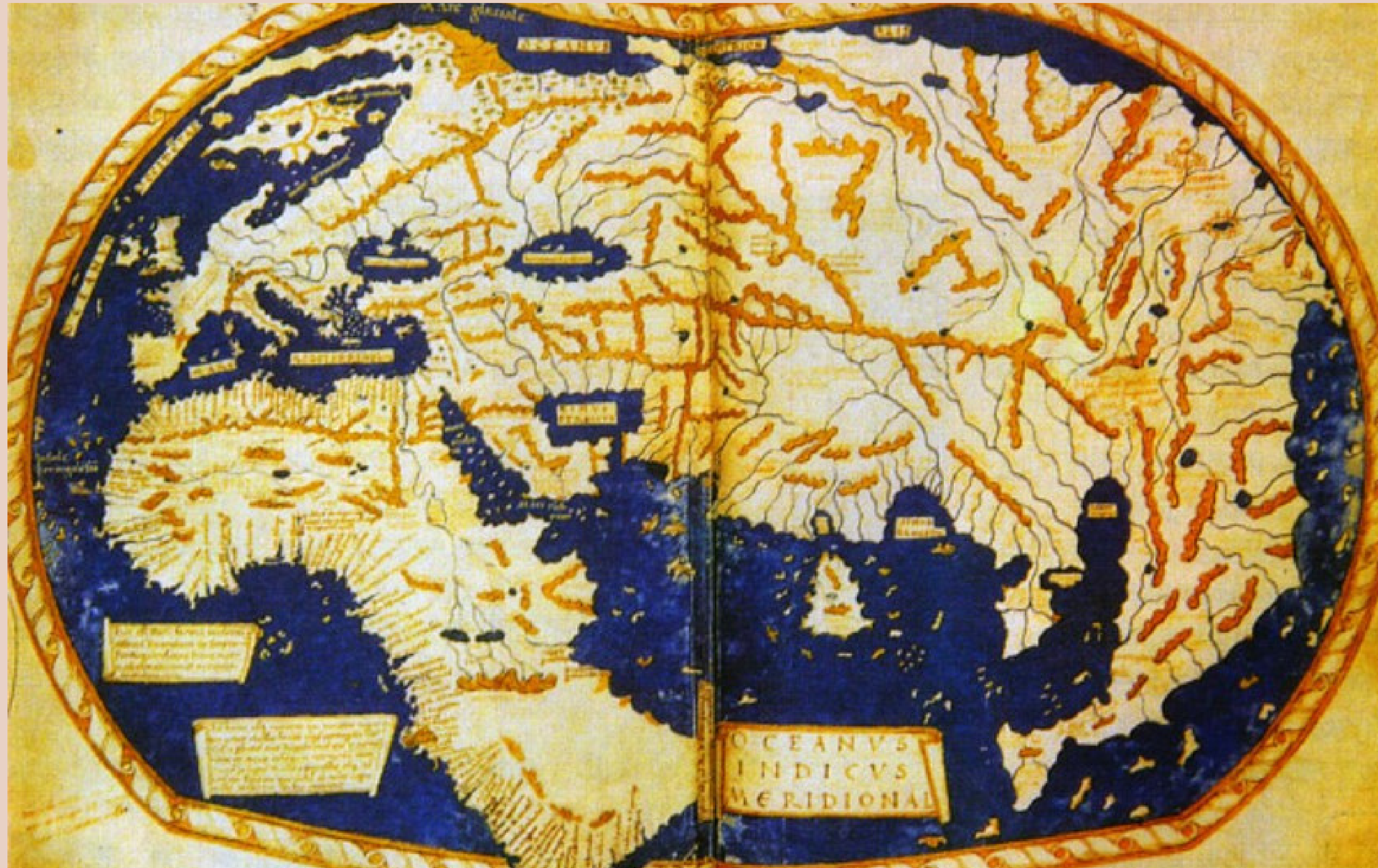
The known world in the 15th century